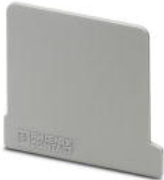
End cover, Length: 42.5 mm, Width: 1.3 mm, Color: gray

Please be informed that the data shown in this PDF Document is generated from our Online Catalog. Please find the complete data in the user's documentation. Our General Terms of Use for Downloads are valid ( http://download.phoenixcontact.com )