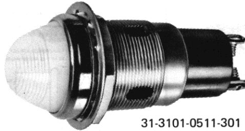
31-3101-0511-301 Torpedo lens