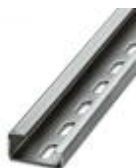
G-profile DIN rail, material: Steel, perforated, height 15 mm, width 32 mm, length 2 m