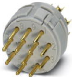
Contact insert, number of positions: 16+3, type of contact: Pin, Solder connection

Please be informed that the data shown in this PDF Document is generated from our Online Catalog. Please find the complete data in the user's documentation. Our General Terms of Use for Downloads are valid ( http://phoenixcontact.com/download )