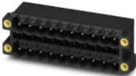
The figure shows a 10-pos. version with 20 contacts

Header, Nominal current: 12 A, Rated voltage (III/2): 400 V, Number of positions: 18, Pitch: 5.08 mm, Color: black, Contact surface: Tin, Assembly: Taped SMD/THT/THR components