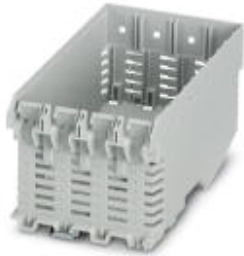
Component housing, length: 120.6 mm, Lower part, color: light gray, width: 75.9 mm, height: 57.7 mm

Please be informed that the data shown in this PDF Document is generated from our Online Catalog. Please find the complete data in the user's documentation. Our General Terms of Use for Downloads are valid ( http://phoenixcontact.com/download )