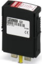
Replacement plug for VAL-MS-T1/T2 75/12.5... plug-in lighting/surge arrester.

Please be informed that the data shown in this PDF Document is generated from our Online Catalog. Please find the complete data in the user's documentation. Our General Terms of Use for Downloads are valid ( http://phoenixcontact.com/download )