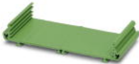
The illustration shows the variant UM 45-Profil CM

Drawn section panel mounting base, with a constructional width of 108 mm and a fixed length of 100 cm