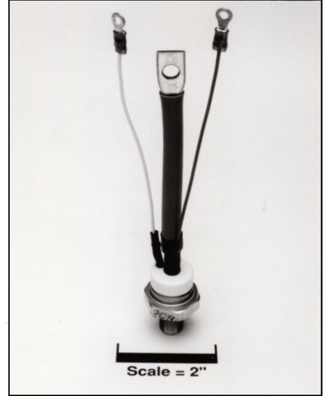
2N1909-2N1792 Phase Control SCR 70 Amperes Average (110 RMS), 600 Volts