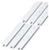
Zack marker strip, Strip, white, Unlabeled, Can be labeled with: Plotter, Mounting type: Snap into tall marker groove, For terminal block width: 20.3 mm, Lettering field: 10.5 x 20.25 mm

Zack marker strip - ZB 20,3:UNPRINTED - 0820248