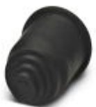
End sleeves, transition sleeves, from hose to cable

Transition sleeve from hose to cable - WP-EC TPE HF 10,0 BK - 3240974