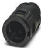
Cable gland, Pg thread, IP66 protection, straight