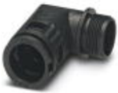
Cable gland, Pg thread, IP66 protection, angled

Screw connection - WP-GA HF IP66 PG7 BK - 3240916