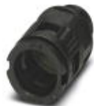
Cable gland, Pg thread, IP68/69k protection, straight