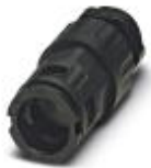
Cable gland, Pg thread, IP68/69k protection, with strain relief

Screw connection - WP-GR HF IP69K PG7 BK - 3240930