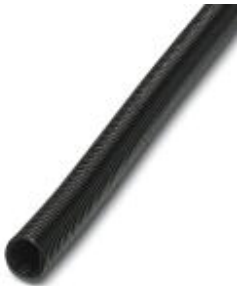
Polyamide protective hose, inflammability class V0, UV resistant

Please be informed that the data shown in this PDF Document is generated from our Online Catalog. Please find the complete data in the user's documentation. Our General Terms of Use for Downloads are valid ( http://phoenixcontact.com/download )