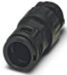
Cable gland, Pg thread, IP66 protection, with strain relief

Screw connection - WP-GR HF IP66 PG7 BK - 3240944