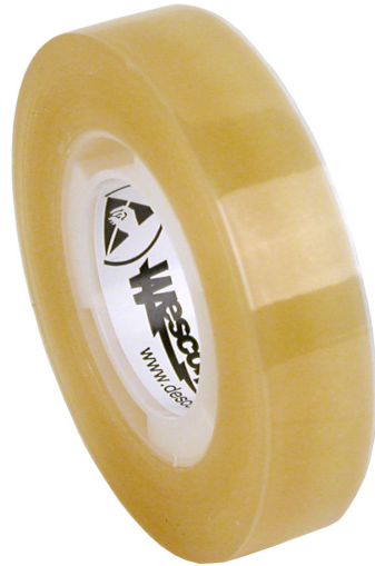
Antistatic Clear Cellulose