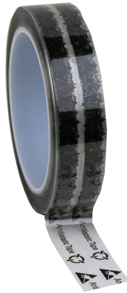
Antistatic Clear Cellulose with Symbols

Tape is wound on a low-sloughing plastic core.