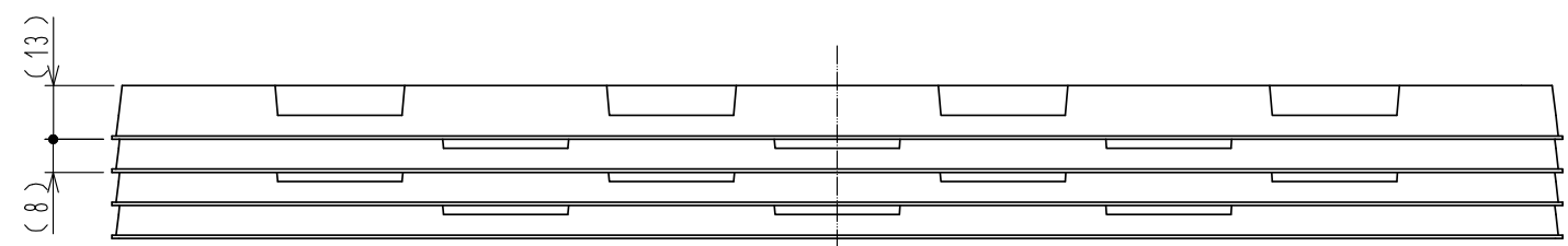
Fig.4 Stacked tray drawing (1:2)