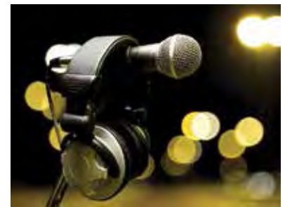
Soft sleeve for reduced noise on floors and in studios.