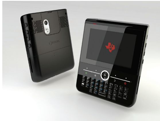
ZOOM OMAP36x MOBILE DEVELOPMENT PLATFORM

At the heart of the Zoom OMAP36x MDP is the Texas Instruments OMAP3630 applications processor that integrates powerful 720p multimedia, 3D graphics, and 8MP imaging