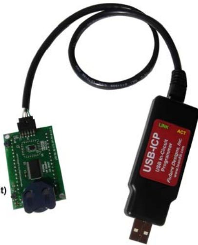
Example User Target Board (Not Part of Kit)

The ISP function uses only six pins: VCC, GND, RXD, TXD, P0.14 and RESETn. The simple circuit above is all that must be added to the user’s application to use ISP with USB-ICP.